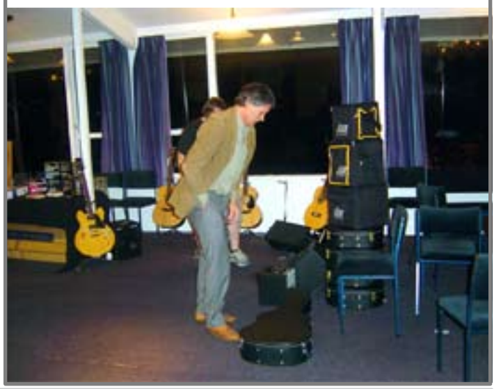
.....I wonder if I could sneak this out under my jacket?

Ponsonby Cruising Club Inc ----- Established 1900 ------ Ph/Fax: 376 0245 Email: functions@pcc.org.nz Web: www.pcc.org.nz